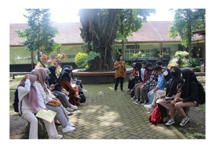
Figure 2. Giving instruction to students at the beginning of the learning

activities around the Universitas Negeri Malang campus areas. The model includes various waste management techniques such as eco-enzymes, ecobricks, briquettes, biomol, and compost production. It has been shown to positively impact students' attitudes towards environmental sustainability (Lestari et al., 2021). The method starts with educating students about waste management's importance and aims to instill a sense of responsibility for waste produced. This approach enhances student behavior identification by building fundamental knowledge onwaste management (Molina & Catan, 2021). The initial activity is shown in Figure 2.