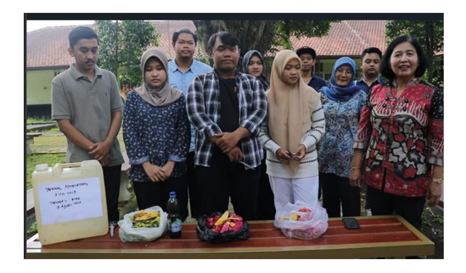
Figure 3. Eco-enzyme production from organic waste.

study has revealed that the utilization of biomol positively impacts the growth of sweet potato plants (Shaji et al., 2021). The use of biomol as a liquid organic fertilizer has an impact on the growth of corn plants. In addition, the utilization of Biomol liquid in the production of compost fertilizer might enhance the rate of decomposition of organic waste.