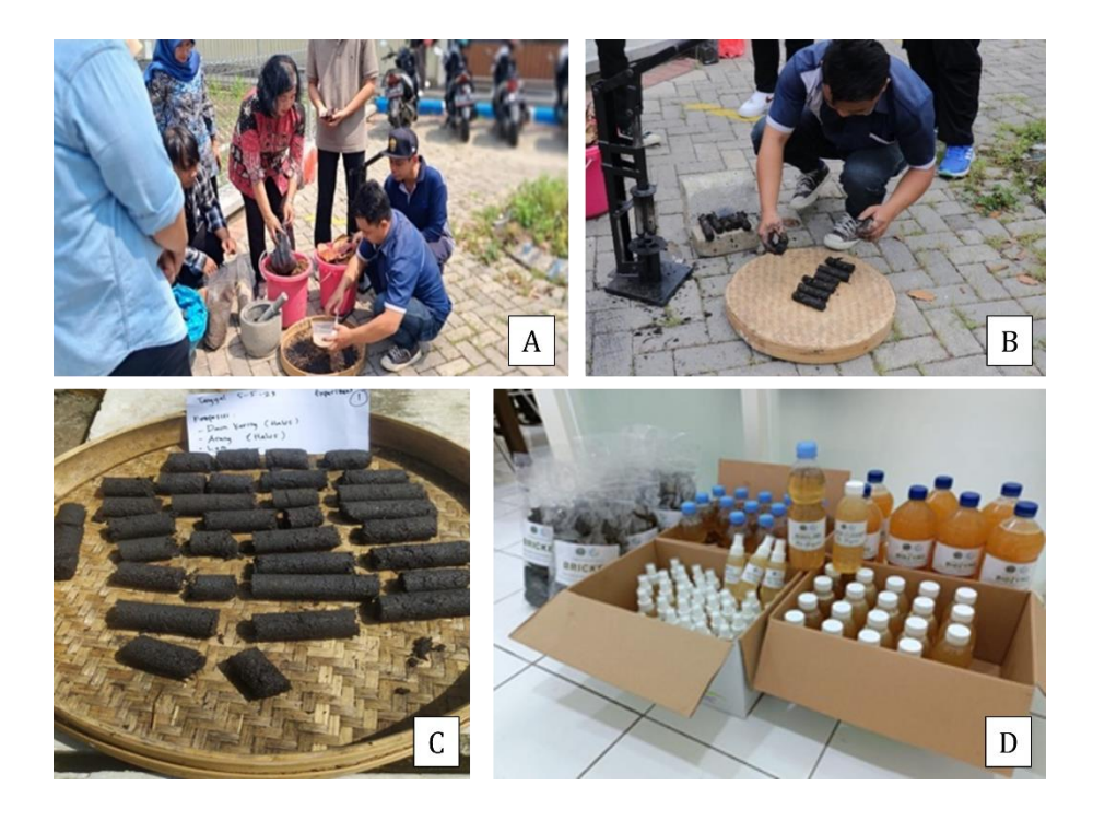
Figure 9. A) Processing organic waste, B) printing briquette, C) making sun-dried briquettes, D) packing briquette.

to create a solid fuel (Kumar et al., 2021). They can be used as an alternative to wood or coal for industry and household use (MS et al., 2020), serving as an ecofriendly energy source with benefits including efficient combustion, practical transportation and storage, and the ability to be recycled from organic waste or biomass. The process includes crushing the collected waste into smaller pieces for processing with other materials before being combined with a binding agent (Haryanti et al., 2021; Marreiro et al., 2021), consisting of ash powder left over from burning, sawdust and coconut shells (Handayani et al., 2023). This mixture is then compressed using a press machine and dried using methods such as sunlight or dryers before they can be used as an alternative fuel for cooking or heating. The process of producing briquette is shown in Figure 9.