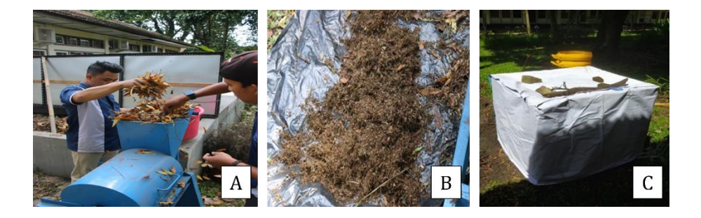
Figure 5. a) decomposition of leaf waste with a grinding machine, b) refined organic waste, and c) compost fermentation boxes to accelerate decomposition

Organic fertilizer is a nutrient source for plants derived from organic substances, including plant wastes, animal feces and other organic components (Shaji et al., 2021). Organic fertilizer is created via a process of natural decomposition facilitated by microorganisms like bacteria and earthworms. These microorganisms turn the fertilizer into nutrients that can be readily absorbed up by plants (Roidah, 2013; Sayara et al., 2020). Prior study has revealed that organic fertilizer plays a significant role in environmental conservation by utilizing organic waste as a fundamental component for its production (Bahri et al., 2022). An important benefit of organic fertilizer is its ability to enhance soil structure and promote soil microbial activity, leading to improved soil fertility (Zhou et al., 2022). In addition, organic fertilizer has the capability to reduce soil erosion, enhance water retention, and minimize use on chemical fertilizers that can have negative impacts on the environment (Assefa, 2019). Further, the processing of organic waste into ready-to-use compost can be seen in Figure 6.