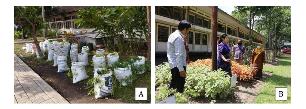
Figure 7. a) Applying fertilizer to sweet potatoes (Ipomoea batatas L), b) fertilizing herbal plants.

Leaf litter was quickly incorporated into a soil excavation, resulting in coarse compost after one month. In the second experiment, the collected leaf waste was ground with a machine and treated with a solution of EM4 or biomol from previous fermentation. The modified storage box accelerated decomposition, producing quicker and more uniform compost used as organic fertilizer for campus plants. This approach also supports recycling efforts and reduces the need to purchase additional compost for campus surroundings.