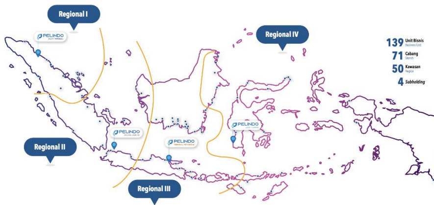
Figure 1. Pelindo Business Regions

Ports play a crucial role in supporting the shipping industry and hence necessitate the implementation of sustainable management practices. The Port of Indonesia, called Pelindo, is a corporate entity providing port and logistical services. Pelindo, a State-Owned Enterprise (BUMN), was officially established on February 5, 1960, and is wholly owned by the Government of the Republic of Indonesia. The legal foundation for the founding of Pelindo is articulated in the Deed of Founding No. 3, executed on December 1, 1992. Pelindo, a significant entity in the port industry of Indonesia, remains dedicated to delivering optimal services within the port and logistics domain. As of December 31, 2022, the Port of Indonesia, a renowned port company in Indonesia, has a workforce of approximately 7,204 individuals employed directly by the company. The corporation possesses a comprehensive network of offices, consisting of one central headquarters, twelve regional ports I & II, twenty-five regional ports III, and twenty-two regional ports IV (Kusumaningrum & Heikal, 2023; Pasaribu, 2023; Pelindo, 2023a).