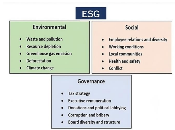
Figure 2. Three key ESG factors

ESG refers to a framework used to evaluate a company's or investment's sustainability and ethical impact. The ESG framework is employed by investors who prioritize environmental, social, and corporate governance factors when making investment decisions (Finger & Rosenboim, 2022). The assessment of the ethical and sustainability implications of investing in a firm involves the utilization of the ESG framework, which comprises three primary elements (T.-T. Li et al., 2021). Most socially responsible investors utilize these ESG factors to evaluate and filter a company's investment opportunities. One of the non-financial performance metrics encompasses environmental, social, and governance factors. The abovementioned concerns encompass ethical considerations, sustainability, and corporate governance, which entail establishing mechanisms to ensure accountability and effectively manage a company's carbon emissions (Business, 2020).