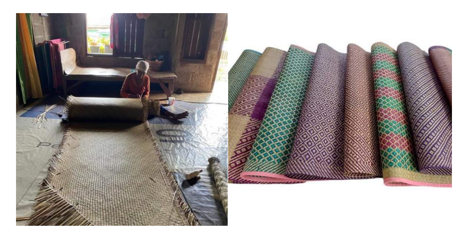
Figure 2. A craftsman and some handicrafts from purun

Handbags, memento boxes, wallets, tissue boxes, and wastebaskets are among the derivatives. In addition, artisans do not have a set production time; instead, they rely only on the time they spend willingly.