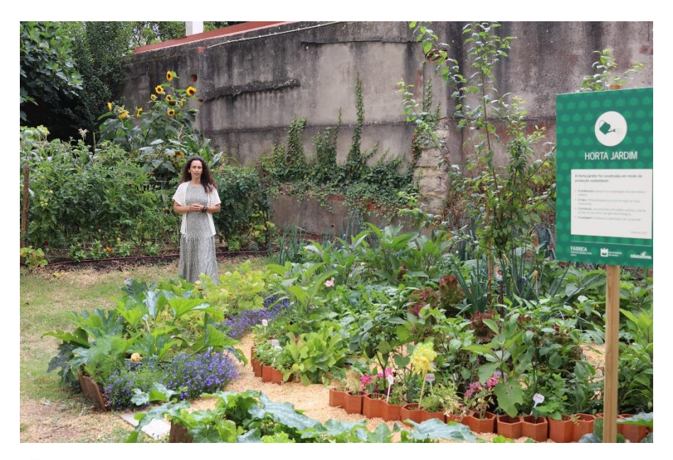
Figure 6. A public session to present the "Nutrients Boomerang" project to the academic community.