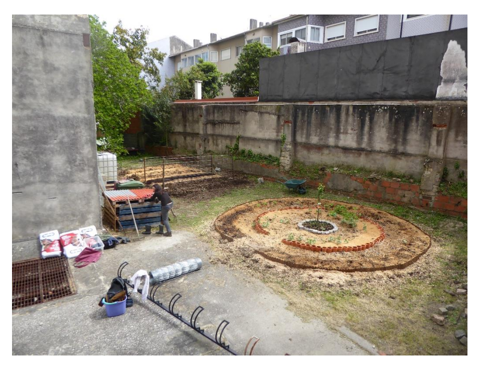
Figure 2. Setting up the rectangular and the circular organic gardens, the composting vertical bin and the reservoir for the irrigation system.

plants considered their height and strata (e.g., herbaceous, shrubby, and arboreal), the natural succession of their life cycles (e.g., annual, perennial), the consociations of proximity between the various plants for crop protection (e.g., pests and diseases biocontrol, natural insect repellent plants), and pollination services stimulation through autochthonous flowers and aromatic plants (Staton et al., 2019).