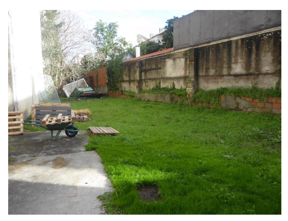
Figure 1. The outdoor space in Fábrica Ciência Viva Science Centre where the project was installed.

Due to the high degree of compaction of the soil, the vegetable beds were manually aerated with a broad fork. The cultivated area was distributed in two distinct gardens: a circular garden inspired in a "mandala", with vegetables, flowers and aromatic plants in a circular geometrical arrangement, and a rectangular garden with the purpose of supporting the circle (Figure 2).