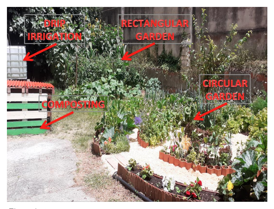
Figure 4. The Pilot model, showing all four components, the composting, the drip irrigation system, the circular and rectangular organic gardens, and the resulting urban green space's landscape. Photography taken in May 2021, close to the beginning of EE/ESD sessions.

The Pilot model was conceived to promote cultural ecosystem service aesthetics through the final landscape, by replacing bare ground with a pleasant space to observe, learn and be involved in nature. The Urban green space landscape was the result of the implementation of the first three components of the Pilot model (Figure 4). It resulted from the transformation of an unused outer area in the FCCV, into an aesthetic and productive "garden", both from agroecological and educational points of view, fully aligned with the FCCV target audience and activities. The model also allowed the FCCV to implement activities in the outer space of the building, which had never been attempted before, due to the lack of suitable projects.