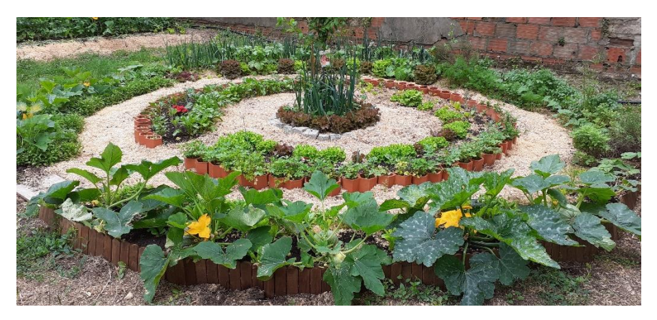
Figure 3. The Circular Garden.

gardening micro-farms (Jeavons, 2008), which are gaining popularity in urban and peri-urban areas around the world. The plantation was initiated in March 2021 and took place every month thereafter.