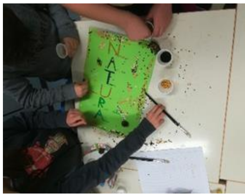
Figure 1 . Example of an acrostic created during the first meeting of the project. The acrostic is composed by "Nascosti nellA Terra Umida Respirano Animaletti" (Hidden in the moist soil little animals breathe).