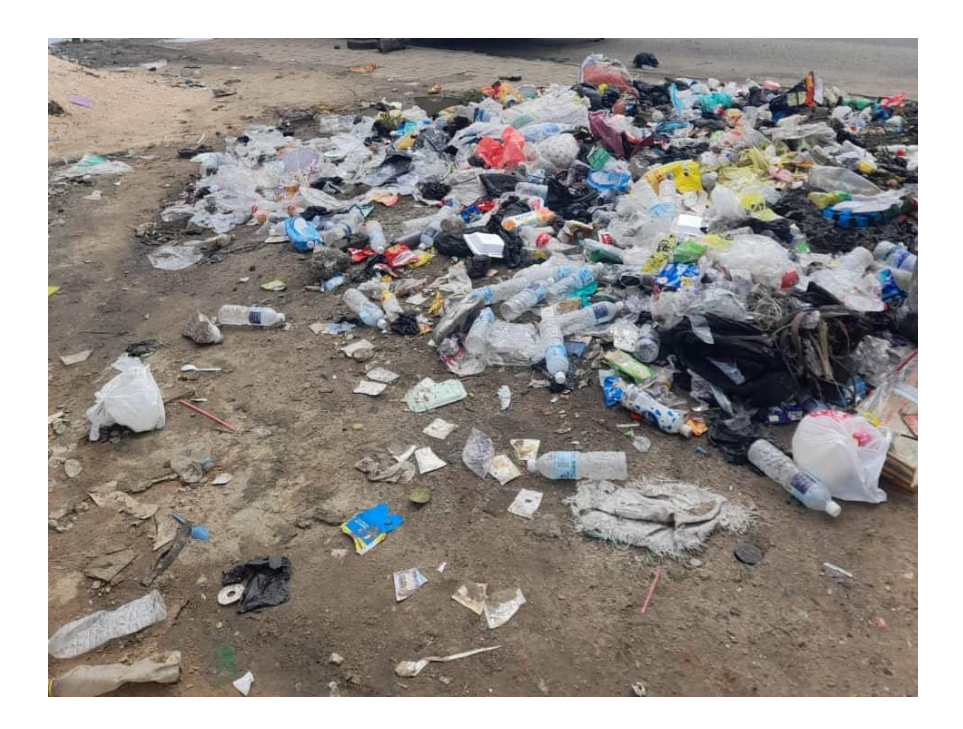
Figure 2. Indiscriminate dumping of waste by resident along the street