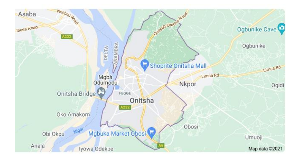
Figure 4. Maps showing Onitsha Metropolis.

A simple random technique was adopted to select 60 women each from the 20 streets, which gave a total of 1200 housewives. The women were selected from those who have been involved in the health literacy programme in the area studied. The instrument used for data collection was a researcher designed questionnaire called the "Health literacy and Proper Solid Waste Disposal Habits among Housewives Questionnaire". The instrument was face validated by two experts in measurement and evaluation form the department of Adult and Non-Formal Education, University of Port Harcourt while the content validity was carried out by psycho-statisticians in Faculty of Education in University of Port Harcourt. The instrument has a reliability index of 0.72%. The instrument was designed on a four-point modified Likert scale. Data collection was carried out by the researcher with the help of two trained research assistants. Data collected was analyzed through descriptive statistics using a statistical package for social sciences (SPSS 25). A decision on each research question was based on a criterion mean of 2.5. Any mean score that is equal to or greater than 2.5 (the criterion mean derived from the four-point Likert scale) is accepted as a positive response (high extent) while any mean score lesser than 2.5 is a negative response (low extent).