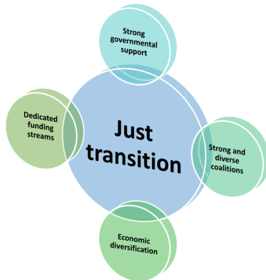
Figure 2. Illustration of four pillars of just transition postulated by J. Minji Cha (2024) by the authors

Act. The four-pillar framework offers valuable insights, particularly emphasizing the crucial role of the public sector as the ultimate employer in maintaining equity.