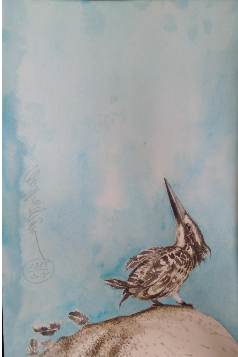
Figure 2. “Kingfisher appalled by violence”: Watercolor by Bui Quang Khiem.