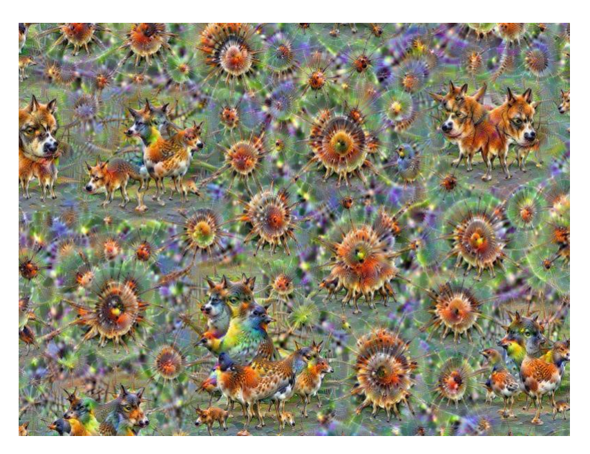
Figure 1 An image generated by DeepDream.

An artificial neural network (ANN) is a computing system inspired by the animal brain that is able to detect relationships within large amounts of data. An ANN is made of layers of so-called artificial neurons, that can receive, elaborate and transmit signals, assigning them a "weight" or a value and thus reproducing the basic mechanisms of attention and perception. ANNs are complex, nonlinear<sup>1</sup> systems whose peculiarity is that they can "learn". If fed with labeled images, an ANN can analyze the given links between input and output and then structure its network accordingly by adjusting the numerical values assigned to its own components. As it happens in language learning, ANNs can associate certain relations to certain recurring traits through trials and errors, and finally generate pseudo-perceptual patterns. This method, called Deep Learning, was largely used for the purpose of image recognition: