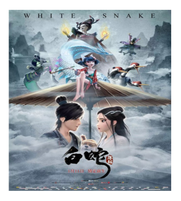
Fig. 2. WS, Official poster. Notably, the two protagonists are portrayed while looking at each other (copyright: Creative commons)

Among the many cinematic adaptations, WS represents the first Chinese feature-length animation, after the release of the Japanese cel animation in 1958. While the Japanese text adds a new, happier ending to the "theatrical thread", WS creates new possibilities by building on the origins ( yuanqi 缘起) of the love story (Wang 2018). This adaption is conceived as a "prequel" that explains why Bai and Xian became pre-destined soulmates ( qianshi yuanfen 前世姻缘), i.e. by fighting evil forces together.