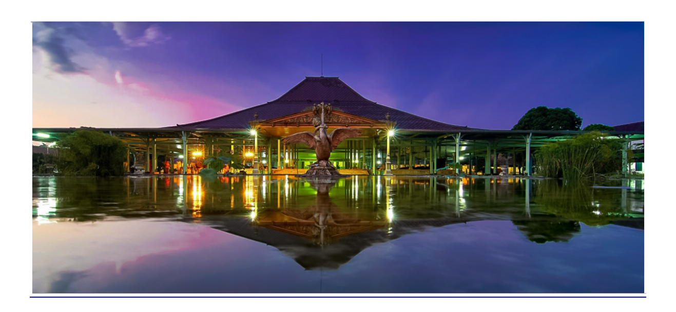
Figure 1. Pendhapi Ageng (The Great Hall) of Mangkunegaran Palace (visualized by Hastuti, 2023).

The three pillars of Mangkoenagoro I's administration emphasized the interconnectedness of humans, nature, and God, promoting common prosperity and shared fate. They also served as a declaration of solidarity, as exemplified by a collective pledge.