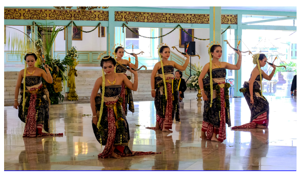
Figure 2. Bedhaya Anglirmendung symbolizes the position of women as estri soldiers.

The women's roles in Praja Mangkunegaran administration were similar to men's, as recorded in Babad Tutur . The leadership of subsequent Mangkoenagoro was more moderate, democratic, firm, and disciplined. R.M. Said requested the royal title of Praja Mangkunegaran kings, using his father's name. Raffles addressed R.M. Said as 'Mas Sayed' and 'Paku Nagara,' referring to his royal title as Prince Adipati Mangku Nagara (Raffles 2008). Mangku Nagara means 'He who carries a kingdom or a country on his lap' (Day 2021: 722), while Mangkunagoro means managing the country.