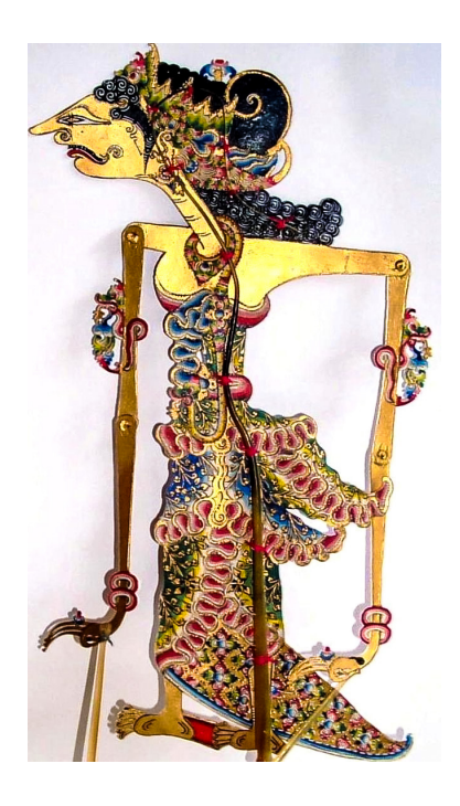
Figure 3. Wara Srikandhi character in the shadow puppet form.

The five wives of Arjuna in the Serat Candrarini script symbolize the five levels of the universe. The Pupuh Sinom song represents this by describing the character of Dewi Wara Sumbadra as the physical or kewadagan universe. The Pupuh Dhandhanggula song portrays Dewi Manohara representing the astral or sensory (feeling) universe. Pupuh Asmarandhana depicts the character of Dewi Hulupi, representing the mental realm or universe of the mind (thoughts). Pupuh Mijil describes Dewi Gandawati representing the realm of buddhi or the universe of consciousness (awareness). Pupuh Kinanthi portrays the character of Dewi Wara Srikandhi representing the realm of true nirvana or the universe of true liberation, which can be achieved by an individual with the highest soul and a keen interest in reading wulang books, and tembang Wisatikandhah songs ( lawan sukane sang ayu, maos sagung srat palupi, kang sekar Wisatikandhah ). The princess is fond of reading books about good things that are exemplary in the form of the Wisatikandhah song. Serat Candrarini explains the existence of goddess and nirvana in Hindu cultural concepts that are adopted to convey Islamic teachings. This indicates K.G.P.A.A. Mangkoenagoro IV's intellectual approach in spreading Islamic principles of justice through the existing culture, encompassing phenomena of life, religion, and art.