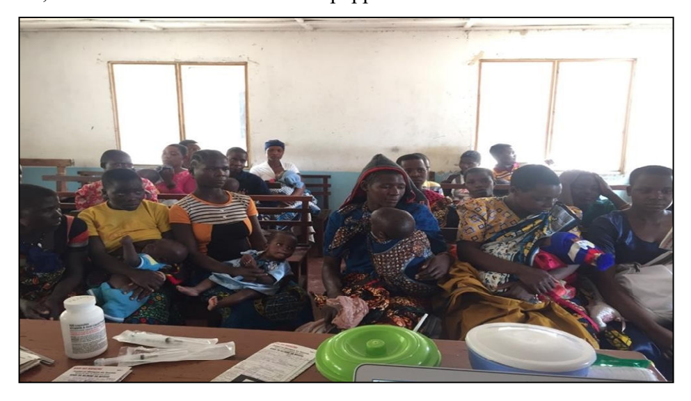
Figure 2. Abbey dispensary, photo taken during the administration of Pappa

In the monastery kitchen there is only one gas stove, while in the villages there are wood stoves. This instrumentation highlighted some problematics in the correct management of cooking. In addition, the lack of a refrigeration system limits the conservation of some raw materials and pappas themselves. For this reason, the pappas have been preparated daily. We went to Sumbawanga's market weekly, consequently the most perishable products last about 4 days for the high temperatures. All these difficulties extended the time for pappas production and compromised their standardization. Immediately after preparation, pappas were administered to the children of the villages in order to verify its acceptability. The presence of the monk-interpreter of the Monastery and of the Doctor of the dispensary (Figure 2), who ensured assistance in case of an allergic reaction, allowed the administration of "pappa di Parma".