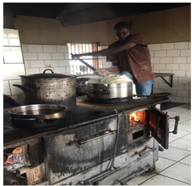
Figure 1. Abbey kitchen

In the monastery kitchen there is only one gas stove, while in the villages there are wood stoves. This instrumentation highlighted some problematics in the correct management of cooking. In addition, the lack of a refrigeration system limits the conservation of some raw materials and pappas themselves. For this reason, the pappas have been preparated daily. We went to Sumbawanga's market weekly, consequently the most perishable products last about 4 days for the high temperatures. All these difficulties extended the time for pappas production and compromised their standardization. Immediately after preparation, pappas were administered to the children of the villages in order to verify its acceptability. The presence of the monk-interpreter of the Monastery and of the Doctor of the dispensary (Figure 2), who ensured assistance in case of an allergic reaction, allowed the administration of "pappa di Parma".