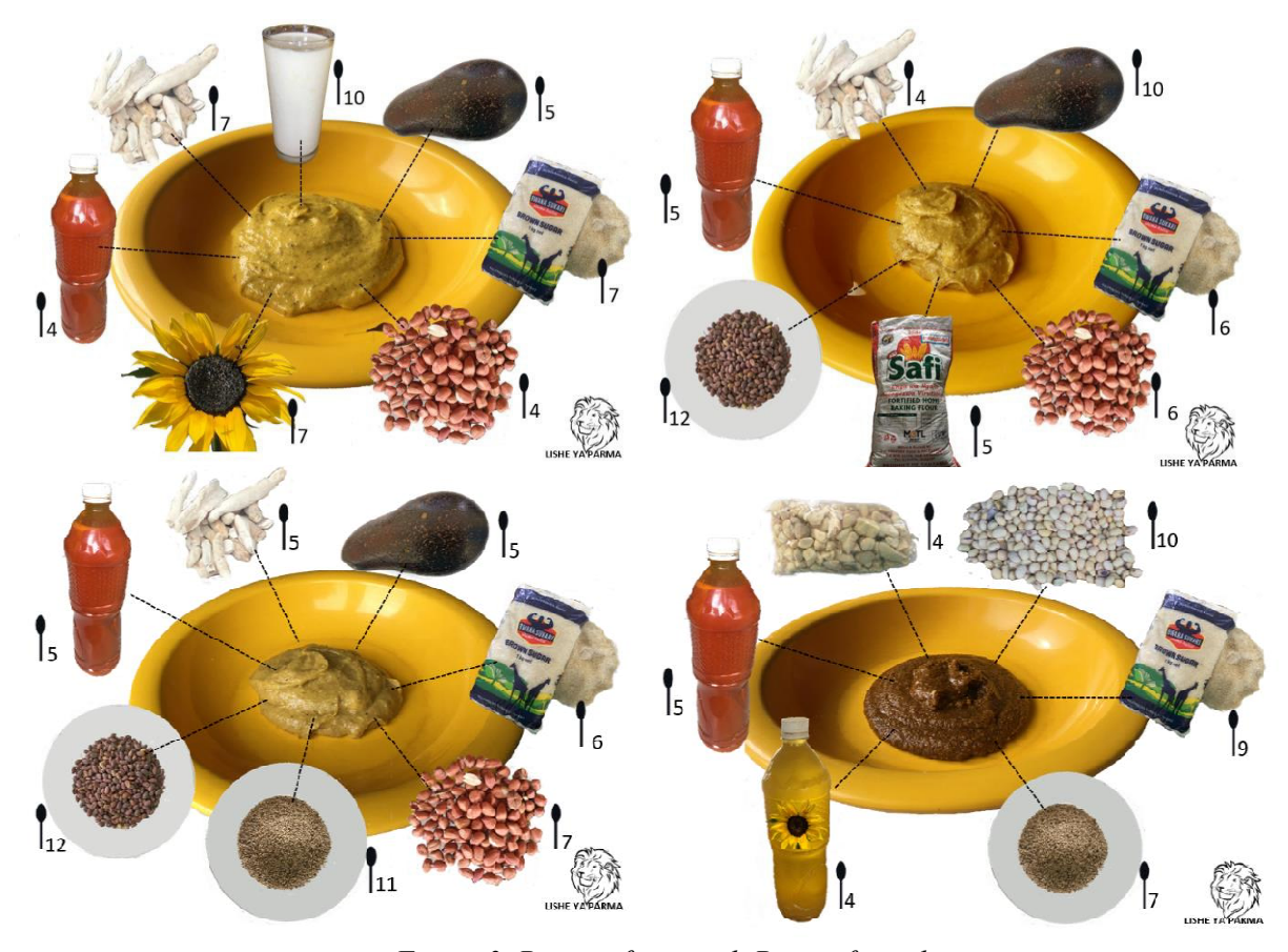
Figure 3. Poster of pappa di Parma formulas

We created four posters depicting the final appearance of the relative four pappas and the required ingredients (Figure 3). The posters have an educational role being self-explicative images. This overtakes the linguistic barrier and population illiteracy. Since the equipment available in the housesof the villages is very rudimentary, it was imperative to find a unit of measure for the dosages of eachraw material. In conclusion, the number of spoons, identified as better unit of measure, was placed near the picture of the ingredients.