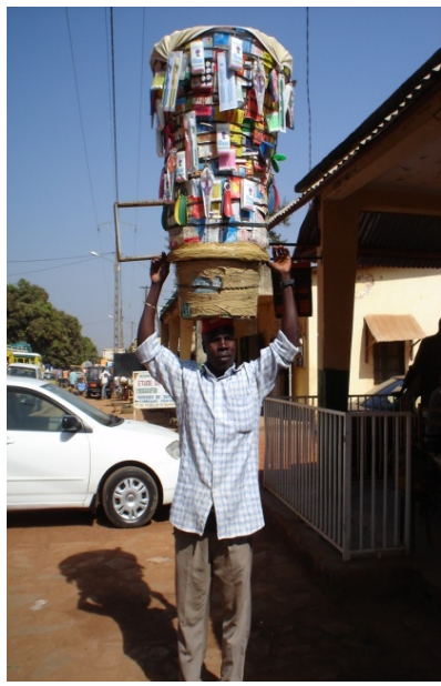
Fig. 1 - Cameroun, street pharmacist.