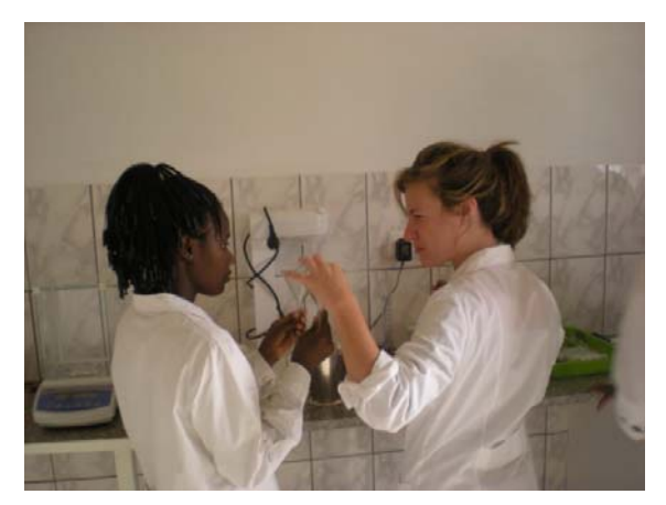
Fig. 4 - Angola, Funda, A.M.E.N. Medical Center.

4. The fourth one concern in a training period (about sixty days) in the hospital, during which the technician, who has been in Italy to learn galenic methods and procedures, will be coordinate in his work by the Pharmacy's students on site (figure 4, 5).