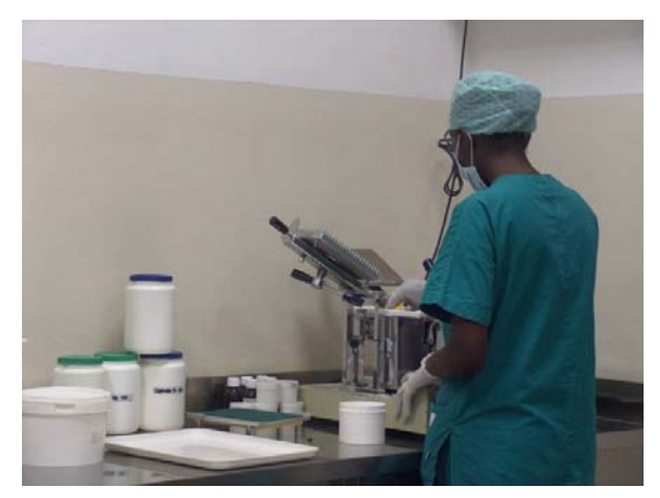
Fig. 5 - Cameroun, Garoua, «Notre Dame des Apòtres Hospital».