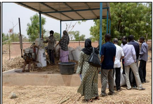
Figure 3 – Production of pellets from agricultural residues (Niamey)