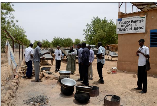
Figure 2 –Study visit to the centre for the improvement of energy production and use (Region of Tillabéri)

The project Russade proposed a new training program, a Master course, with a systemic and multidisciplinary approach, organized through an active network between the four partner universities. Thanks to the educational offer of the course, students' capacities were reinforced in the various strategic areas, such as livestock, agriculture, food security and environmental protection (Semita et al., 2014b), with the aim to enable them to face the challenges and constraints of rural development and to take into account the links between the different themes (Figures 2, 3 and 4).