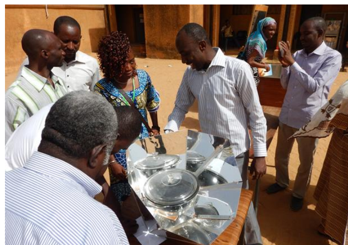
Figure 4 - Practical courses to test the effectiveness of solar ovens and the possibility of reducing and contrasting deforestation, by P. Barge.