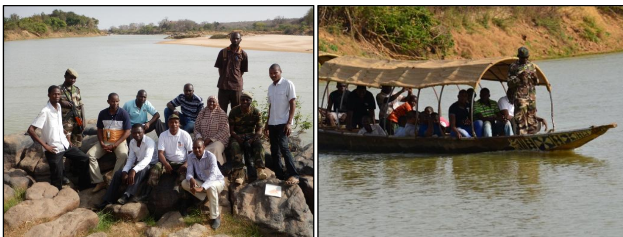
Figures 5 and 6 –Field trip to protected areas: the students’ visit was guided by the teachers and staff of the W National Park.

Most of the courses have seen the integration of teachers from different universities delivering the lectures, including experts of ONGs, the International Fund for Agricultural Development (Ifad) of the United Nations, Delegation of the European Union Commission in Niger, the Protected Areas Division of the Nigerien Ministry of the Environment and from the staff of the Regione Piemonte (Cerutti, 2017). Moreover theoretical courses were alternated with practical courses: 8 field trips were carried out with the local support of the ONG Terre Solidali and the administration of the W National Park (Fig. 5 and Fig. 6). Seminars/debates, open to the participation of other students and researchers, completed the educational offer.