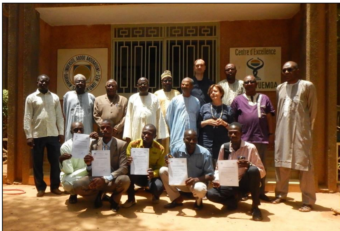
Figure 7 –The international Commission of the Master evaluated the candidates after their final dissertation, by B. Mola.