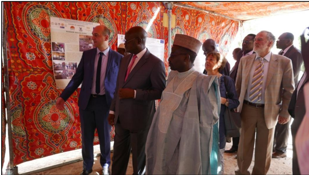
Figure 8 – Closing workshop of the project in N'Djamena (Chad). Visit of the delegates to the posters exhibit.