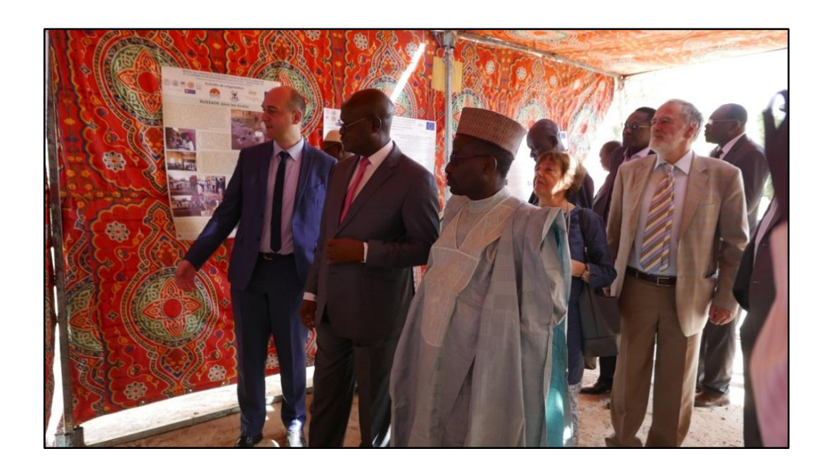
Figure 8 – Closing workshop of the project in N'Djamena (Chad). Visit of the delegates to the posters exhibit, by P. Barge.