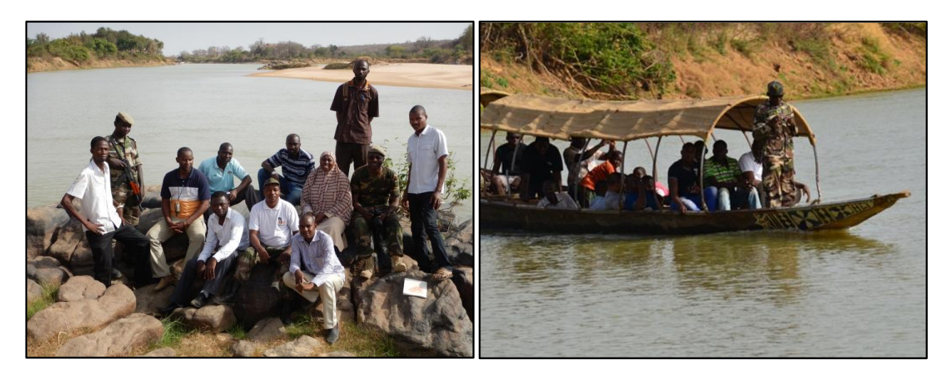
Figures5 and 6 —Field trip to protected areas: the students' visit was guided by the teachers and staff of the W National Park.

Most of the courses have seen the integration of teachers from different universities delivering the lectures, including experts of ONGs, the International Fund for Agricultural Development (Ifad) of the United Nations, Delegation of the European Union Commission in Niger, the Protected Areas Division of the Nigerien Ministry of the Environment and from the staff of the RegionePiemonte (Cerutti, 2017). Moreover theoretical courses were alternated with practical courses: 8 field trips were carried out with the local support of the ONG Terre Solidali and the administration of the W National Park (Fig. 5 and Fig. 6). Seminars/debates, open to the participation of other students and researchers, completed the educational offer.