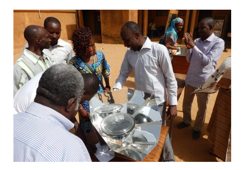
Figure 4 - Practical courses to test the effectiveness of solar ovens and the possibility of reducing and contrasting deforestation, by P. Barge.