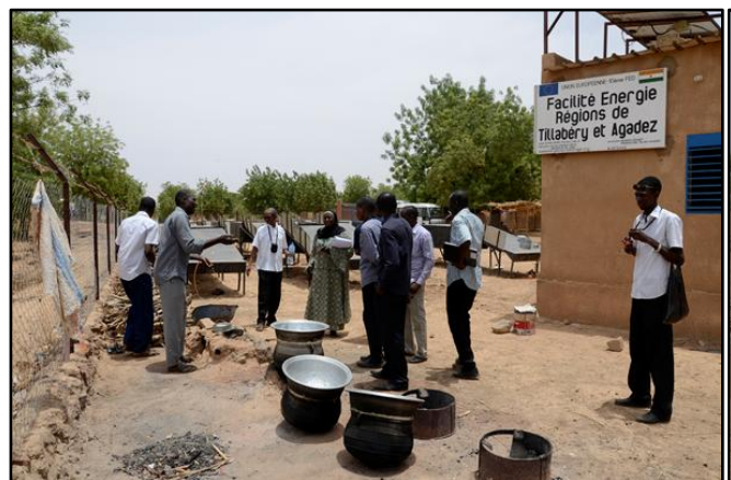
Figure 2 –Study visit to the centre for the improvement of energy production and use (Region of Tillabéri)

The project Russade proposed a new training program, a Master course, with a systemic and multidisciplinary approach, organized through an active network between the four partner universities. Thanks to the educational offer of the course, students' capacities were reinforced in the various strategic areas, such as livestock, agriculture, food security and environmental protection (Semita et al., 2014b), with the aim to enable them to face the challenges and constraints of rural development and to take into account the links between the different themes (Figures 2, 3 and 4).