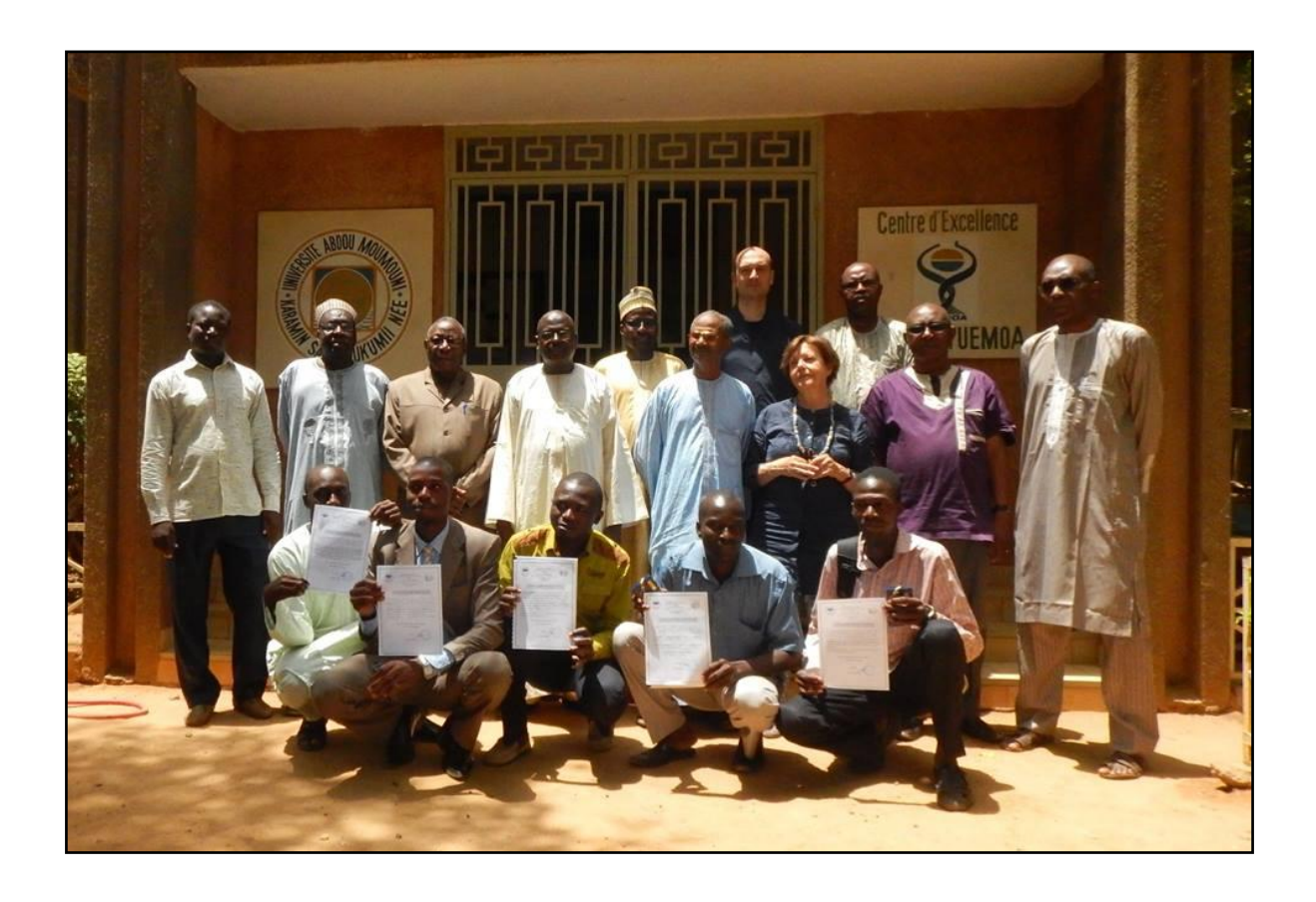
Figure 7 –The international Commission of the Master evaluated the candidates after their final dissertation, by B. Mola.