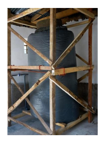
Fig. 3 - Stove fed by biogas and biogas gasometer

Considering all these aspects it is relevant underline that support the diffusion of this technology in specific geographical areas and in specific social and environmental contexts, could be a good argument to promote the development of rural communities, empowering the lives of inhabitants, especially of the weakest part of the population, usually involved in domestic issues and eventually consequent damages and accidents.