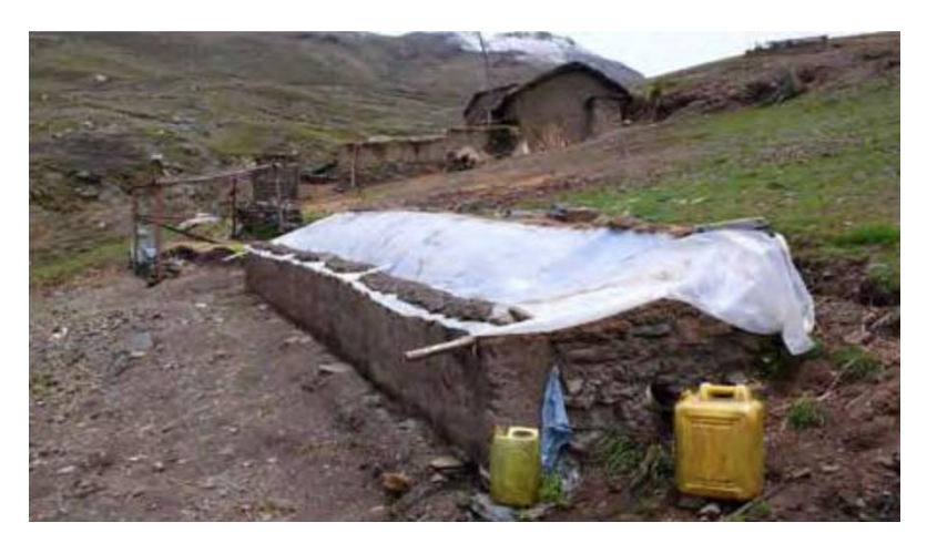
Fig. 1 - Low cost tubular biogas plant

The selected biogas plant has been the so called tubular digester (fig. 1), an insulated tank composed by a tubular plastic bag closed on both sides. This volume is laterally distended on the ground and the organic manner lays in its lower part; the inlet and outlet ducts are attached directly to the skin of the balloon at the two lateral sides. As a result of the longitudinal shape, the digested flow is conducted through the reactor in plug-flow a manner. The organic matrix, inside this oxygen-free ambient, starts to be subjected to the anaerobic digestion process and, after a precise number of days principally defined by the internal temperature, to the biogas production. The biogas produced is collected in the upper part of the digester, increasing its pressure together with the biogas volume. At the desired pressure, in the order of few bar, the biogas is acquired and, after some different treatment in order to purify its chemical composition, it is stored ready to be used.