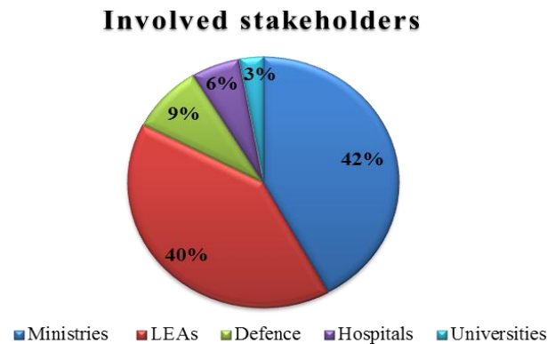
Figure 3 - Percentage of involved stakeholders in the CBRN incident command training course in seven Sea countries. LEAs: Law-Enforcement Agencies.

During the interactive table-top exercises and the hands-on simulation sessions, it has been possible to perform a general survey and analysis on the points of strength and weakness of the local situation in the field of CBRN inter-agency strategic response preparedness and capabilities.