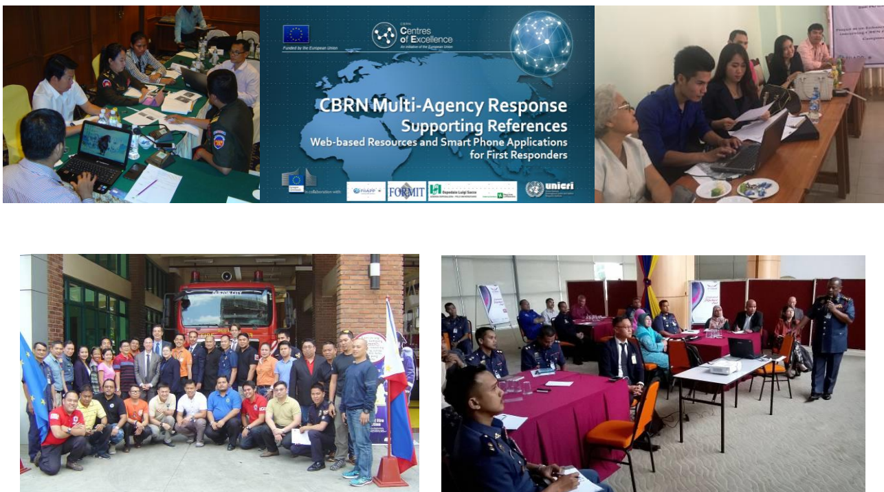
Figure 2 - CBRN incident command course training sessions in Cambodia (top left), Lao (top right), the Philippines (bottom left) and Malaysia (bottom right). Training module on electronic and web-based resources for CBRN first responders and incident commanders (top centre).

Then, especially in those countries in which a response capability in major CBRN events was already present or well established, the Project leaders have designed and tailored a syllabus for the training activities in collaboration with the representatives of the most relevant local governmental agencies.