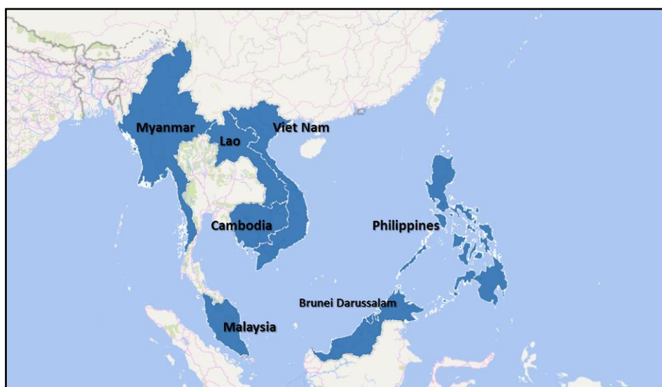
Figure 1 - Countries of South-East Asia region involved in European Union CBRN Risk Mitigation Centres of Excellence Project no. 46 initiative: Lao, Cambodia, Viet Nam, Myanmar, Brunei Darussalam, Malaysia and the Philippines

In the first part of this Project, a team of Italian scientists active in national research and academic institutions have been collaborating, under the coordination of Fondazione Formit (Italian non-profit foundation promoting institutional projects linked to innovation and technology transfer), with governmental stakeholders, national agencies and technical partners in seven countries of South-East Asia (Sea), namely: Lao, Cambodia, Viet Nam, Myanmar, Brunei Darussalam, Malaysia and Philippines (Figure 1).