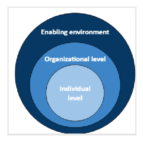
Figure 2 – The three levels of capacity (based on Undp, 2009)

all three levels, directly or indirectly, in order to trigger a deep and sustainable change in the whole society.