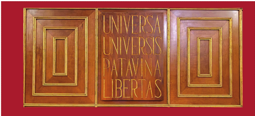
Historical plaque of the University of Padua, cover illustration for Scientiae in the History of Medicine.

ature (with the late E.J. Aiton, not unexpectedly, as a recurring comet) and is always very clear but also enough technical as the subject matter requires: 17 th -century cosmology is co-substantial, so to say, with decisive progress in algebra and analysis and with the birth of modern mechanics and dynamics, both enterprises to which the book protagonists contributed substantially. The authors show more interest in the cosmological theories per se, and their interplay and mutual conditioning with philosophical theories and Weltanschauungen , than in the latter as such; and this is one of many reasons why this book is so solid, and will be found so useful by any reader interested in its subject matter and themes.