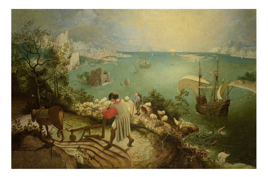
Figure 1. Landscape with the Fall of Icarus, by or after Pieter Bruegel the Elder (Musées royaux des Beaux-Arts de Belgique, Bruxelles, https://artsandculture.google.com/story/ewUxXpmuNdcLJg).