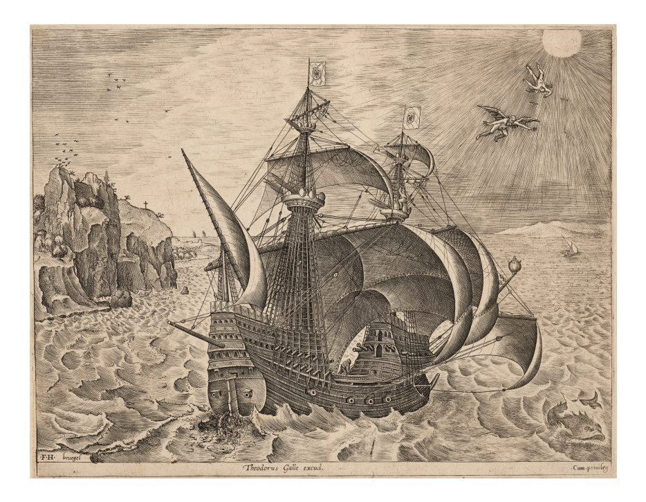
Figure 3. Frans Huys and Theodoor Galle, after Pieter Bruegel the Elder, Man-of-War with the Fall of Icarus, about 1560 (Indianapolis Museum of Art at Newfields, https://collections.discovernewfields.org/art/artwork/28439). A naval warship courses through choppy coastal waters, while Daedalus flies below Icarus. Icarus without wings, is no longer able to fly, and falls to earth.