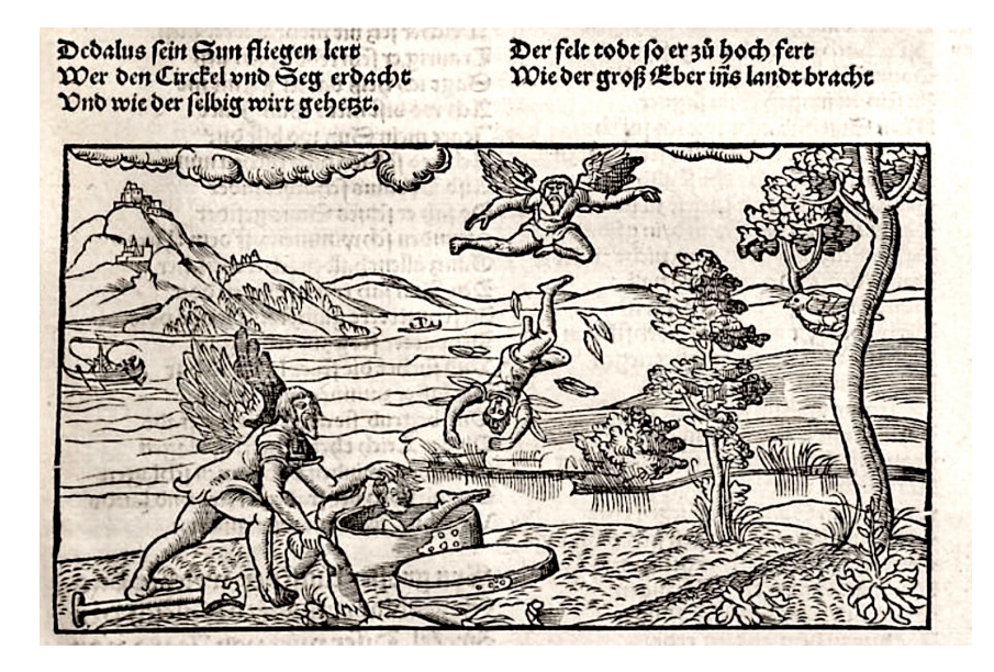
Figure 2. Woodcut illustration by Georg Wickram ( P. Ouidij Nasonis deß aller sinnreichsten Poeten Metamorphosis , Mainz, Ivo Schöffer 1545, f. y2r). Two phases of the action portrayed in a single illustration: Daedalus watching as Icarus falls from the sky (top central); and Daedalus stuffing Icarus' body parts in a bin to be buried in a grave he will dig (central foreground and shovel on left).