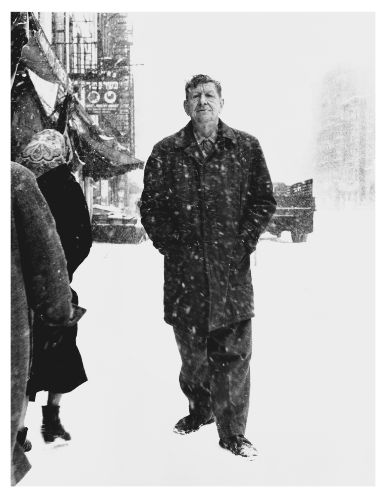
Figure 6. W. H. Auden, St. Mark's Place, New York, March 3, 1960.