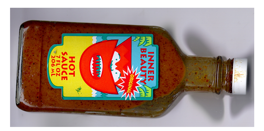
Inner Beauty.

give to them (...) who knows how they may quicken (...) in their chains, in their glass jars. You think it cruel (...) to quicken them, when they are fixed, imprisoned? No (...) no. Deeply, deeply, they wish to respond to your touch, to your look, and when you smile, their joy (...) is unbounded. And so I say to you, tender the dead, as you would yourself be tendered, now, in what you would describe as your life.<sup>1</sup>