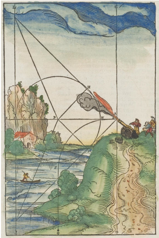
Walther Hermann Ryff, Der furnembsten, notwendigsten, der ganzen Architectur angehoerigen Mathematischen und Mechanischen kuenst eygentlicher bericht, Nürnberg: Petreius 1547, f. 4v.