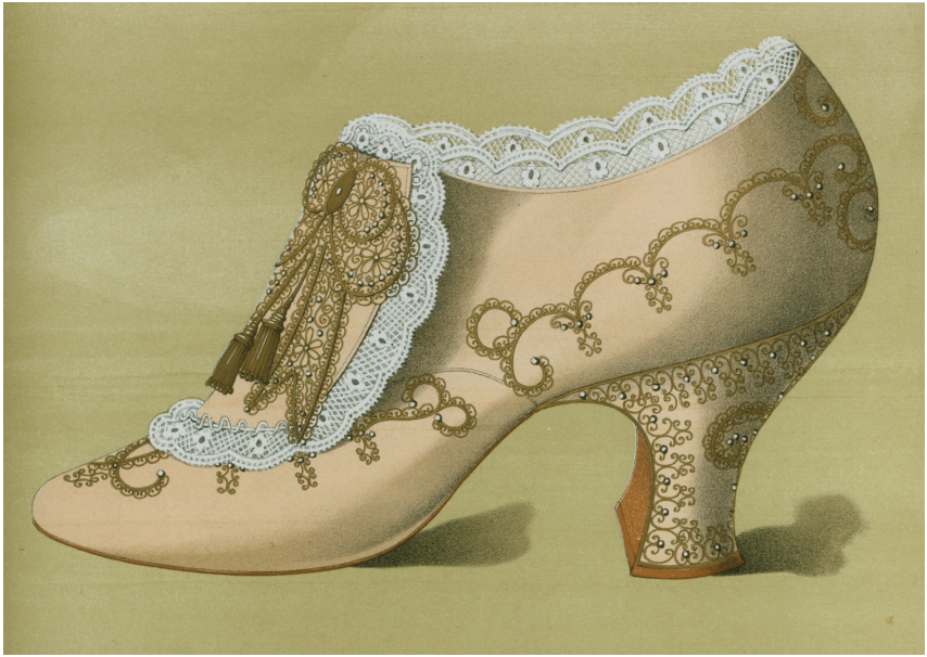
“Imperial shoe, with lace, gold embroidery, beadwork, and knot of gold lace and tassels”, in T. Watson Greig, Ladies’ Dress Shoes of the Nineteenth Century: with Sixty-Three Illustrations, Edinburgh, D. Douglas, 1900.