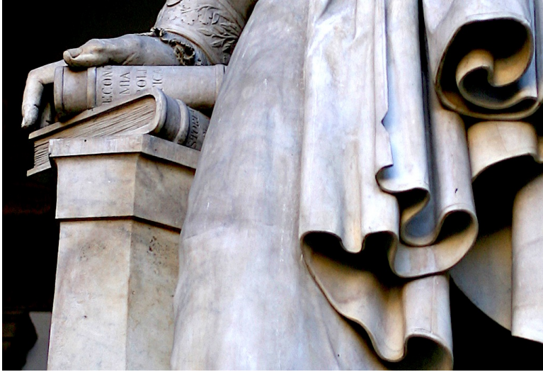
Innocenzo Fraccaroli, Monumento a Pietro Verri (1844), Accademia di Brera, Milano, partic.