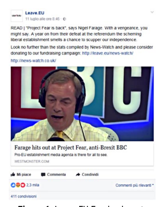
Figure 6: Leave.EU Facebook post.