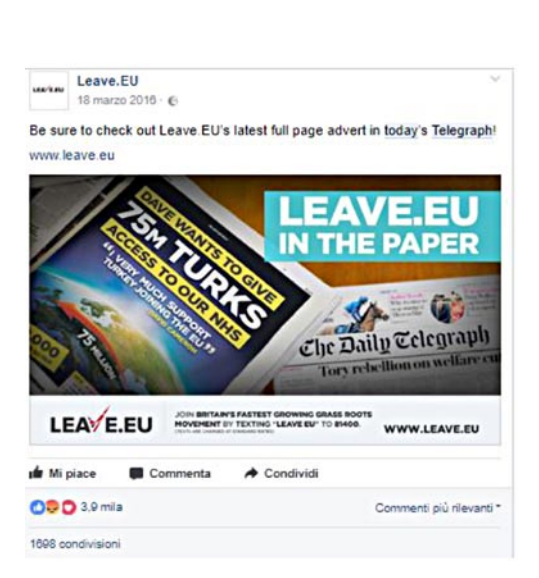
Figure 11: Leave.EU Facebook post.

The flow of immigrants towards the UK is thus identified as a conspiracy of the élites against the British people. Thus, the polarization 'Us vs Them' or, stated otherwise, the betrayed and the migrants is evident. One can also note the use of simply in the third title and the implicit need/call, simple to understand, for