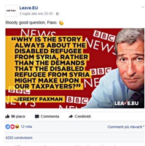
Figure 10: Leave.EU Facebook post.