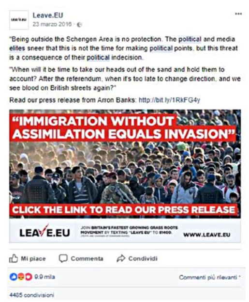
Figure 12: Leave.EU Facebook post.

The third title also indicates an important shift in the communicative strategy: while in the previous ones the impossibility of debating on the topic immigration was advocated, now several generic elements are offered to imply that there is no need for a debate anymore, since the situation is clear, simply . The Z-score<sup>23</sup> (table 1) for immigration reveals a typical pattern of the ideological language whose aim