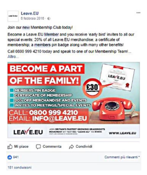
Figure 18: Leave.EU Facebook post.

die, and the risk this peculiar FAMILY is facing. Other posts warn supporters of the importance of this key-concept with reassuring smiling multi-ethnic members (figure 19).