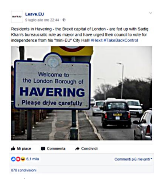
Figure 16: Leave.EU Facebook post.

The other is the endorsement of the UKIP positions after the results of the referendum. The page is still very active in reframing the current stall of the negotiations with Brussels and trying to 'mask' possible accusations of xenophobia. On the one hand they report an attempt of independence from the rule of Sadiq Khan's bureaucratic "Mini-EU" by the London Borough of Havering (figure 16).