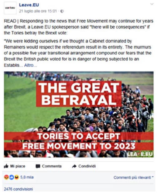
Figure 5: Leave.EU Facebook post.

and the ability to listen to the people and understand their needs. Figure 4 depicts these concepts while several other posts, like figure 2, add the message: "Join Britain's fastest growing grass roots movement".