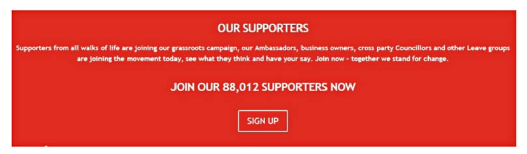
Figure 3: The supporters of Leave.EU in its website.

psychologically the function of publishing these figures was to exhort those who were undecided to join and to create a domino effect. On 17 January 2016 the page announced that they had reached 400,000 supporters (figure 2). The official website, last checked on 1 October 2017, declares 88,012 supporters (figure 3).