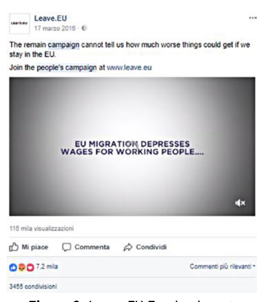
Figure 8: Leave.EU Facebook post.