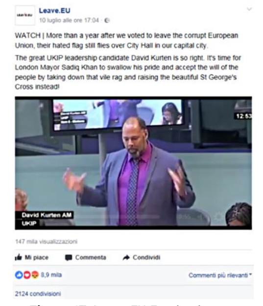
Figure 17: Leave.EU Facebook post.