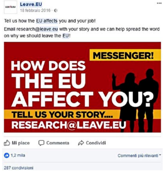
Figure 4: Leave.EU Fastbook post.

In this sense Mudde (2004: 544) considers populism as a thin-centred ideology in opposition to thick-centred ideologies such as fascism and communism.