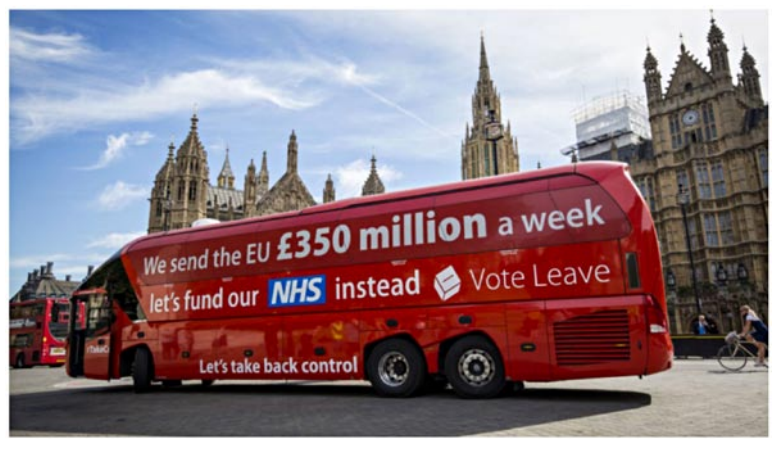
Figure 1: The Vote Leave bus

Since, as Musolff (2017: 11) has observed, the Vote Leave campaign leveraged on a semantic and pragmatic deterioration of the slogan, and CM Britain is the HEART OF EUROPE, then other CMs such as EUROPE IS A COSTLY MACHINE and (IM)MIGRANTS ARE A DANGER can be considered part of the same set of problematic issues that campaigners identified to rally British public opinion. It is evident that behind their communicative strategy there is a cognitive perspective that considered