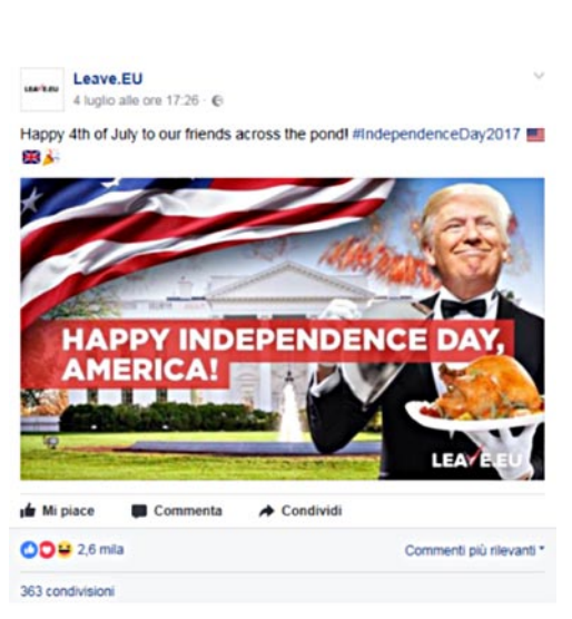
Figure 15: Leave.EU Facebook post.

The other is the endorsement of the UKIP positions after the results of the referendum. The page is still very active in reframing the current stall of the negotiations with Brussels and trying to 'mask' possible accusations of xenophobia. On the one hand they report an attempt of independence from the rule of Sadiq Khan's bureaucratic "Mini-EU" by the London Borough of Havering (figure 16).