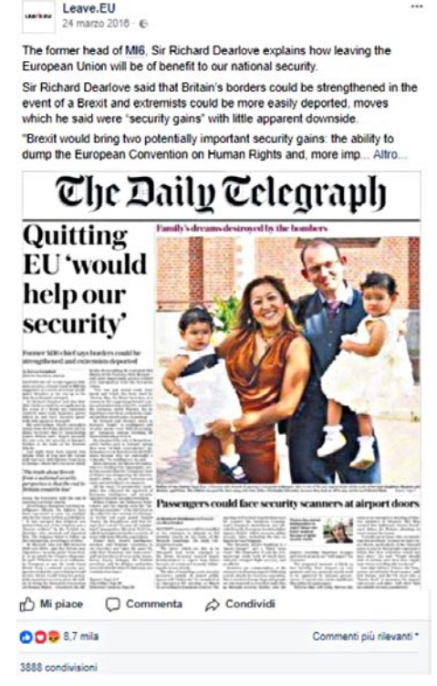
Figure 19: Leave.EU Facebook post.

In this case, too, similar examples can be found in the Daily Mail corpus with titles like: