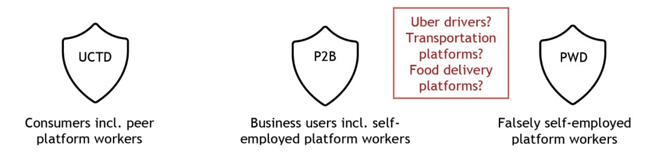
This Figure illustrates three existing legal instruments that have the ability to shield different categories of platform workers from unfair terms imposed by digital labour platforms.

Firstly, consumers and peer platform workers are shielded by the UCTD against unfair terms imposed by platforms. Despite the ratio legis being a form of weaker party protection, the UCTD's scope is limited to B2C contracts, thereby excluding the majority of platform workers as they are self-employed under B2B contracts.