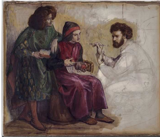
Figure 5 - Dante Gabriel Rossetti, Giotto Painting the Portrait of Dante , 1859 (ca.)

Together, the three versions simultaneously produce an interart, transcultural, and self-reflexive work of art. Firstly, they visually render the lines Dante dedicated to Giotto, Cimabue, Guido Guinizelli, Guido Cavalcanti, and himself in the XI canto of the Purgatorio . Secondly, the transpositions delve into Dante's reception of contemporary painters and poets. Thirdly, the artists Dante mentions to define his identity become personae through which Rossetti shapes his own identity, both personal and cultural, and expresses his aesthetic beliefs.