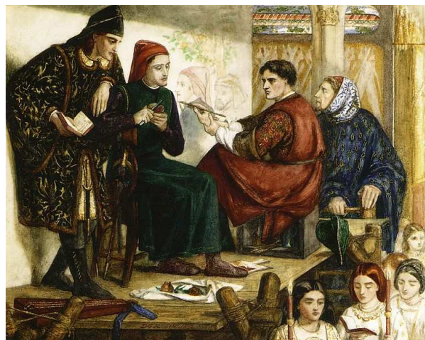
Figure 4 - Dante Gabriel Rossetti, Giotto Painting the Portrait of Dante , 1852