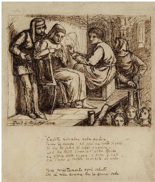
Figure 3 - Dante Gabriel Rossetti, Giotto Painting the Portrait of Dante , 1852

Rossetti portrayed Giotto who paints the portrait of Dante in the 1852 pen and ink drawing [Fig. 3], the 1852 watercolour [Fig. 4] and the 1859 unfinished watercolour and pencil on cream paper [Fig. 5].