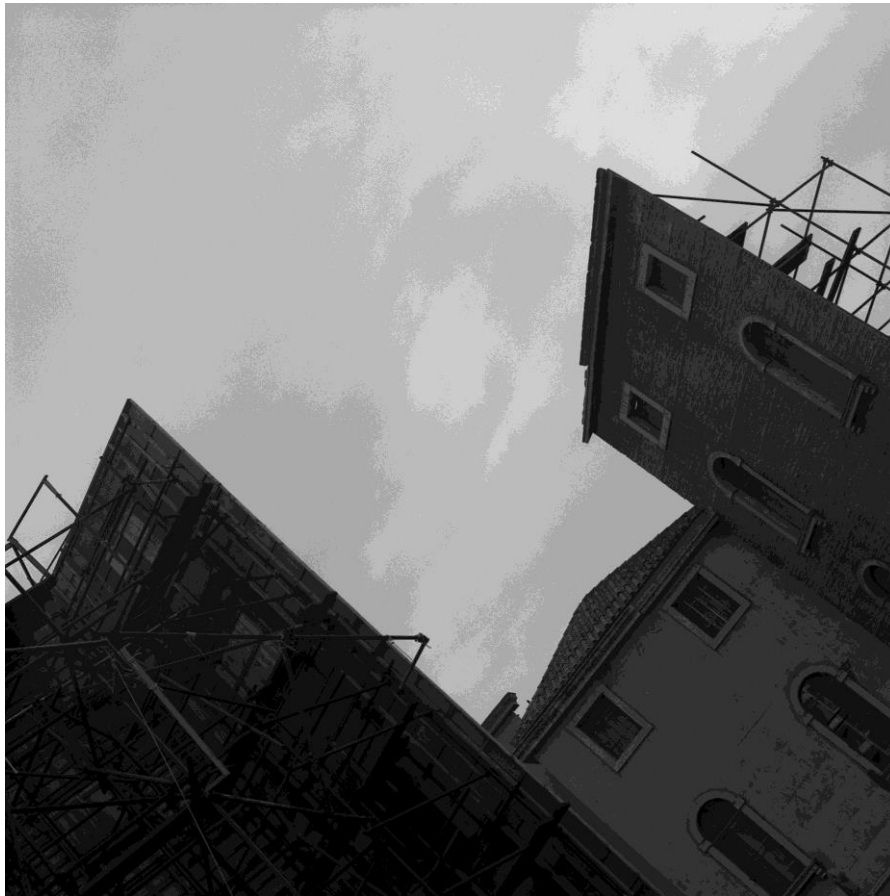
Fig. 3. Benjamin, Talens, García-Alix 2012, 82.

Paris created the type of the flâneur . What is remarkable is that it wasn't Rome. And the reason? Does not dreaming itself take the high road in Rome? And isn't that city too full of temples, enclosed squares, national shrines, to be able to enter—with every cobblestone, every shop sign, every step, and every gate-way—into the passerby's dream? The national character of the Italians may also have much to do with this. For it is not the foreigners but they themselves, the Parisians, who have made Paris the promised land of the flâneur —'the landscape built of sheer life;' as Hofmannsthal once put it. Landscape—that, in fact, is what Paris becomes for the flâneur . Or, more precisely: the city splits for him into its dialectical poles. It opens up to him as a landscape, even as it closes around him as a room.