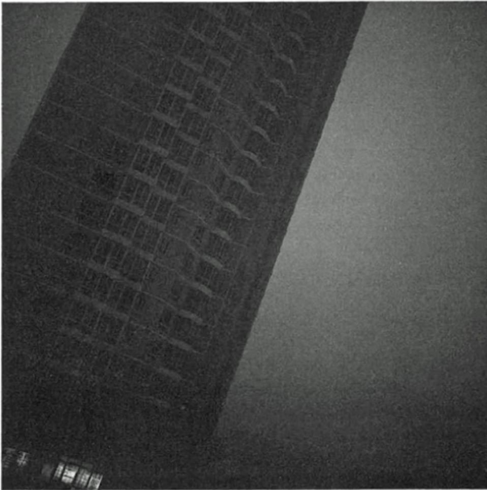
Fig. 2. Benjamin, Talens, García-Alix 2012, 73.

For the first time in history, with the establishment of department stores, consumers begin to consider themselves a mass. (Earlier it was only scarcity which taught them that.) Hence, the circus-like and theatrical element of commerce is quite extraordinarily heightened. (Benjamin, 2002, 43).